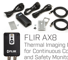
FLIR AX8 Thermal Imaging Camera for Continuous Condition and Safety Monitoring and Starter Kit