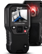
FLIR MR160 FLIR Imaging Moisture Meter