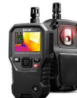
FLIR MR176 IGM™ Moisture Meter with Replaceable Hygrometer