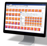
FLIR Thermal Studio Pro 1 year Subscription