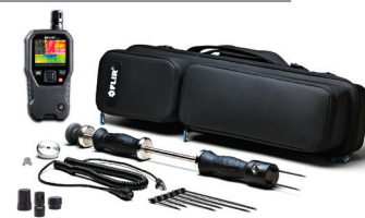
FLIR MR176-KIT5 Professional Imaging Moisture Kit